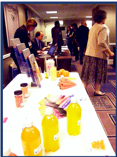
IACM Global Color Conference Sept2014 Terminal 5 EXHIBITS